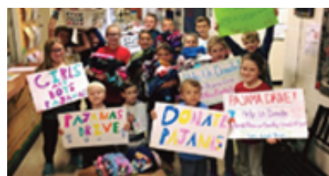
Wilder PTA pajama drive