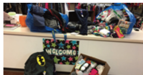
Disney PTA sock, undie & pants drive

The PTA Clothing Bank is such a special place, and we continue to be blessed by those we work with and those we serve. If you haven't had a chance yet, please visit us some Thursday and hang out with us awhile. We know you'll fall in love with it just like we did!